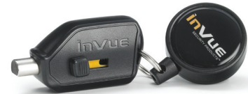
SFKEYNDRL / SFKEYRFRL

The Orthogonal Magnet OM Key™ generates a perpendicular force that provides a more secure interface with the internal socket and shuttle mechanism. The keys come standard with EAS coils (AM or RF) included.